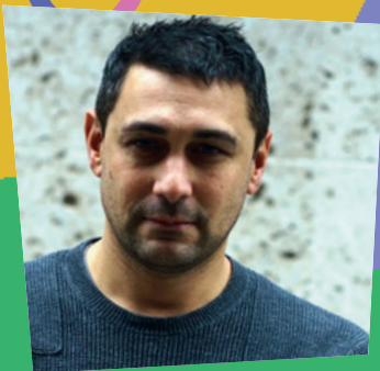
MAGGIE ADERIN-POCOCK 19TH OCTOBER, 7.30PM ADAM RUTHERFORD 24TH OCTOBER, 7.30PM