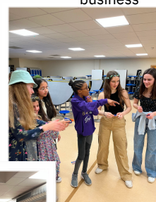
Nerf wars are a serious business