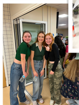
Nerf Champions, Team HAP