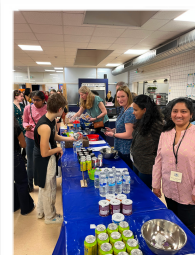
PA volunteers- at the heart of all we do