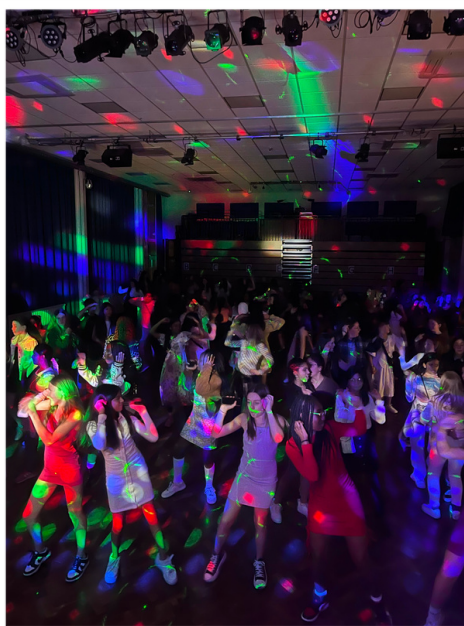
Dancing the night away in the hall