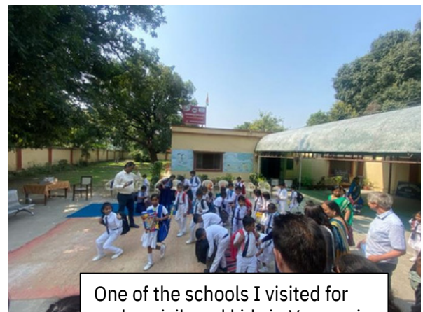
One of the schools I visited for underprivileged kids in Varanasi