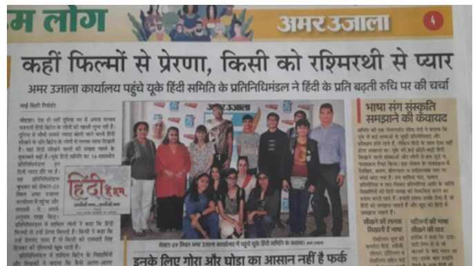
Us in one of the newspapers