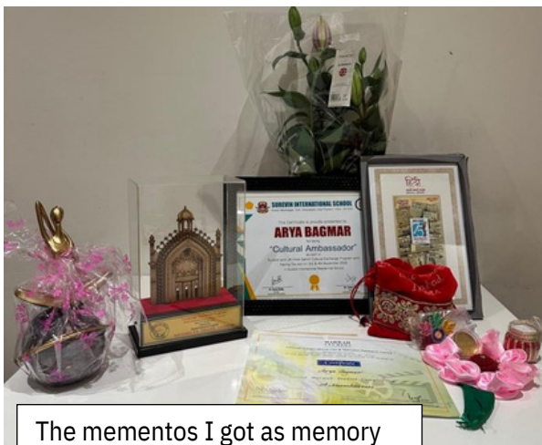
The mementos I got as memory