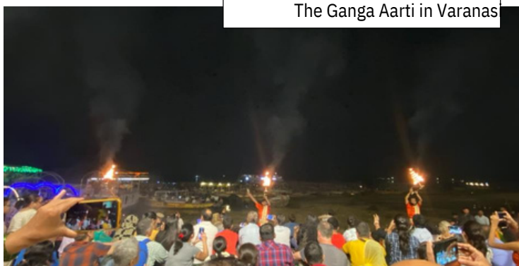
The Ganga Aarti in Varanasi