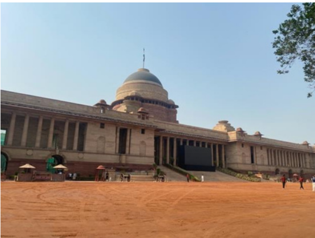
The Rashtrapathi Bhavan in New Delhi

My trip consisted of 5 main cities which were Delhi, Agra, Lucknow, Varanasi/Banaras and Ghaziabad, all of which were my first time visiting. In the first part of my trip, we got a private tour around The Rashtrapathi Bhavan which is the Indian president's house and government office in New Delhi. I got to see all the state rooms, and the prestigious Darbar Hall, which is where the most prominent and highest ranked awards are given such as the Padma Shri and Padma Bhushan; the new prime minister is also appointed here in an important ceremony. The highlight of visiting the Rashtrapathi Bhavan was certainly finding out where Donald Trump sat at the dinner table and seeing the different ornaments gifted by other countries to India.