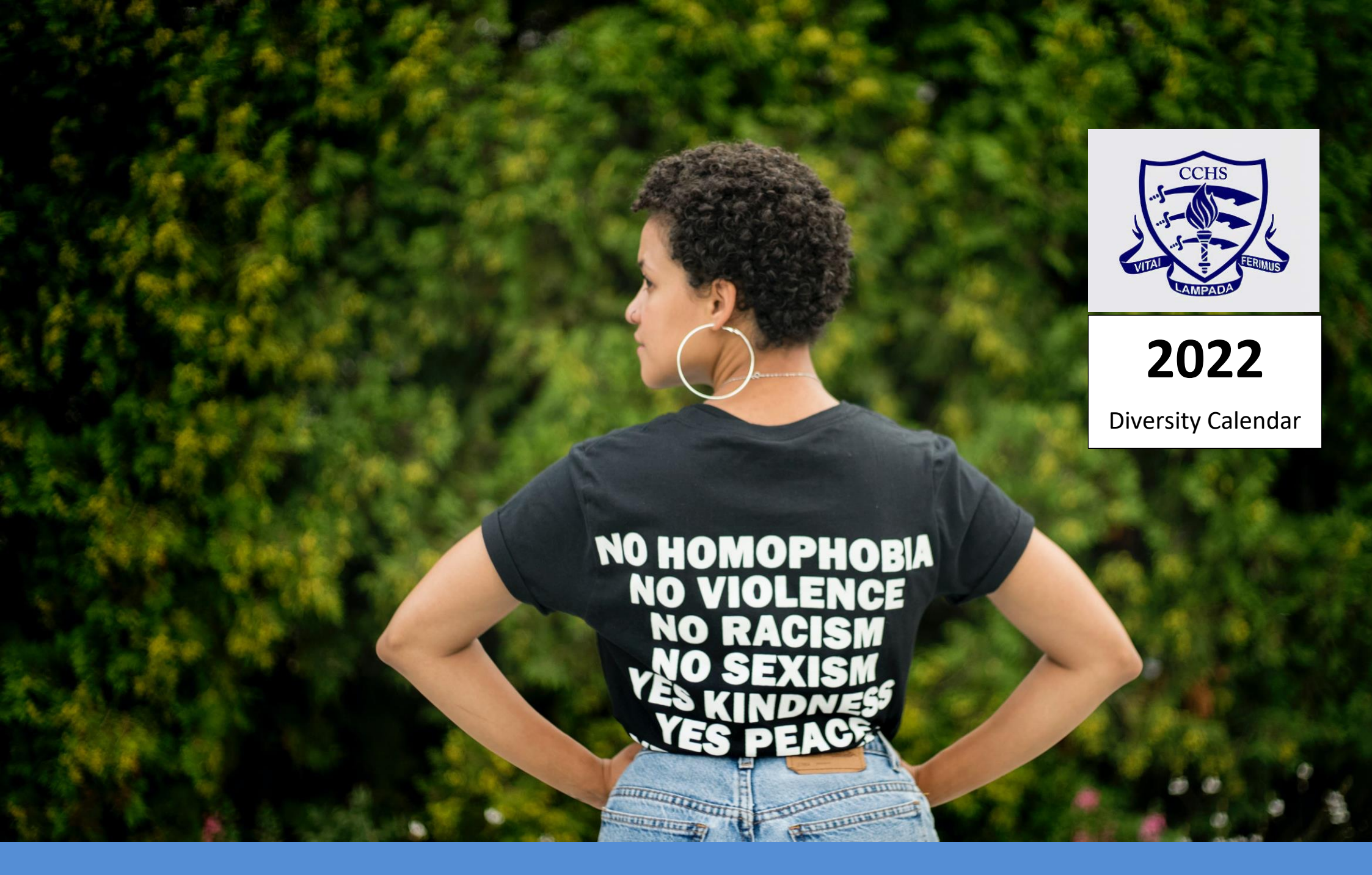
Equality and Diversity UK