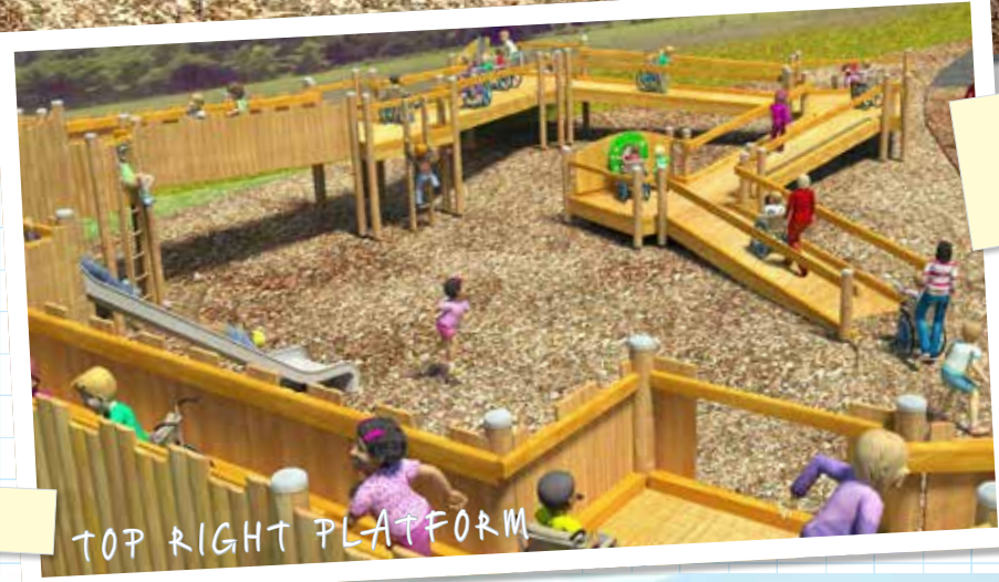
TOP RIGHT PLATFORM