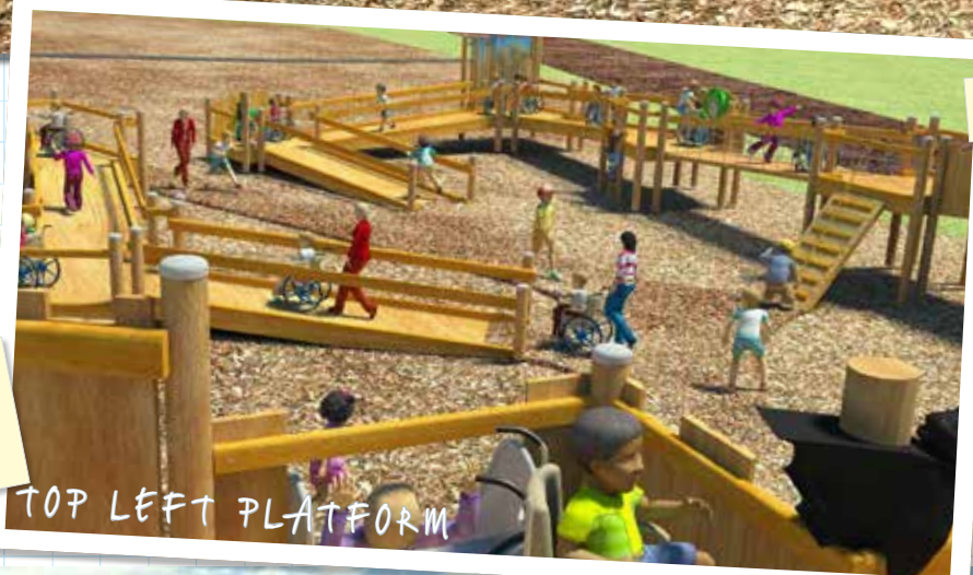
TOP LEFT PLATFORM