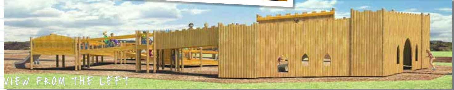
VIEW FROM THE LEFT