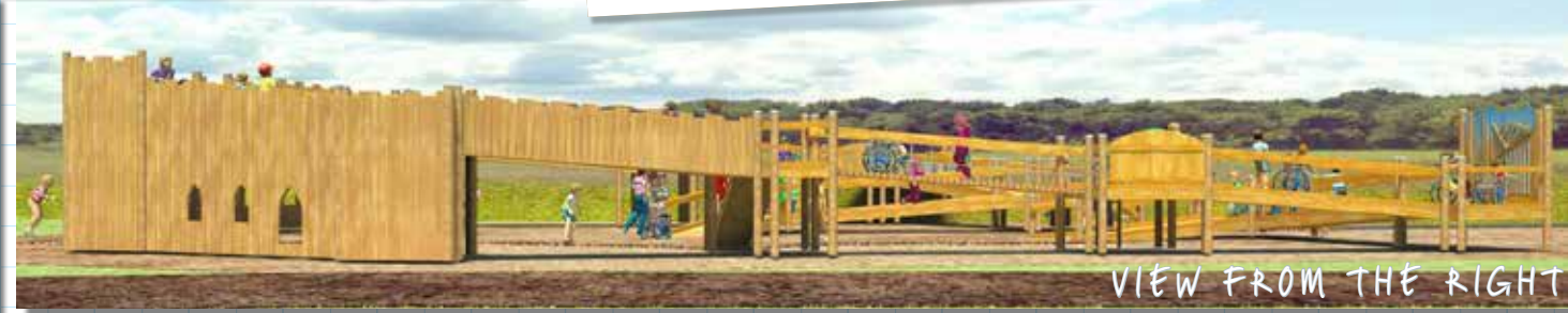
VIEW FROM THE RIGHT