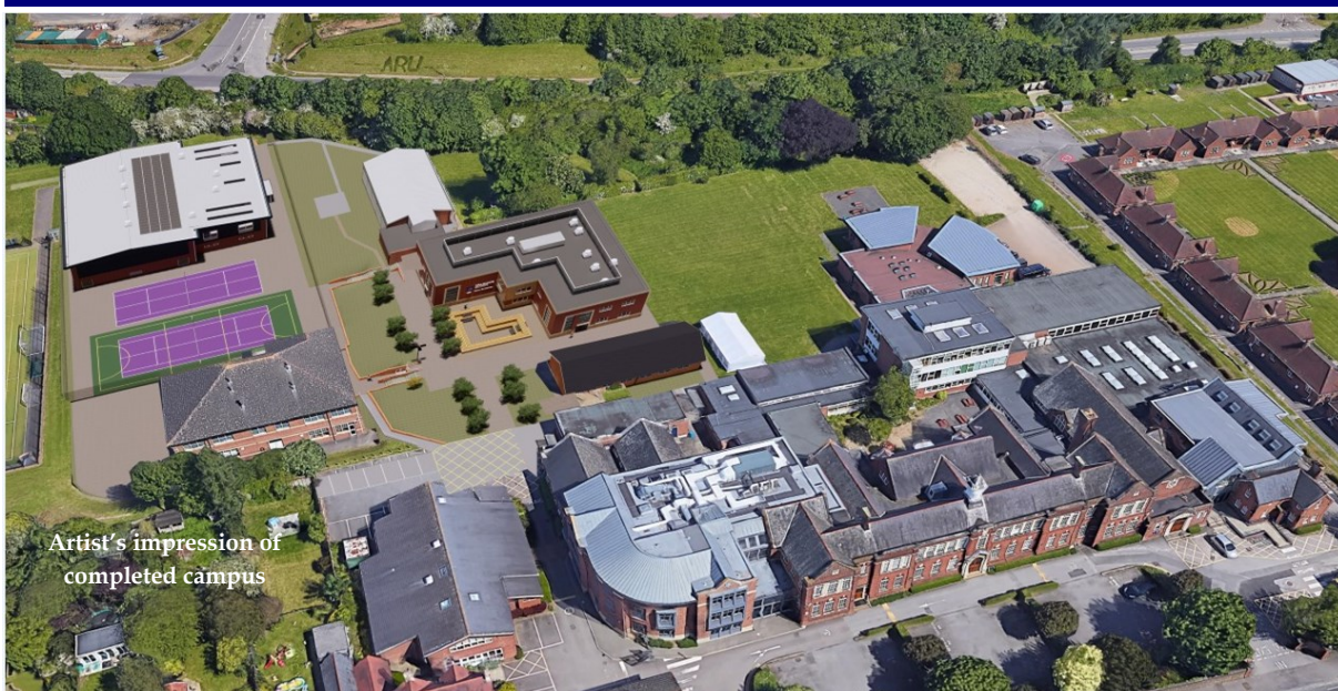
Artist's impression of completed campus